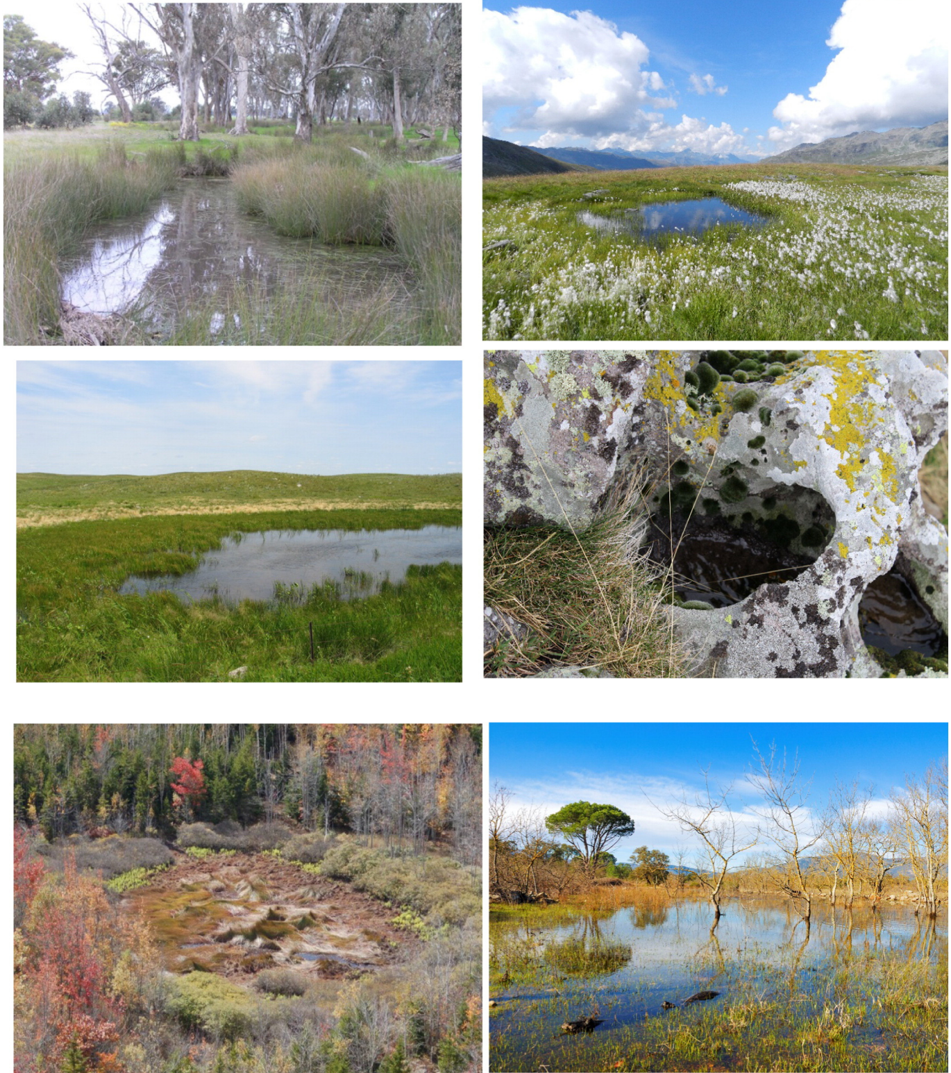
Fig. 1. Examples of temporary wetlands (clockwise from top left): Gilgais amongst Plains Grassy Woodland, Monea North Nature Reserve, Victoria, Australia (photo: J. Fitzsimons); Alpine seasonal pools, Val Thorens, alt. 2520 m, French Alps (photo: F. Isselin); Great Plains prairie pothole, North Dakota, USA (photo: D. Mushet); small rock pool, Massif Central alt. 1500 m, parc naturel régional des volcans d'Auvergne, France (photo: F. Isselin); dry vernal pool, Acadia National Park, Maine, USA (photo: A. Calhoun); Mediterranean temporary pond, Alberta piedmont, Catalonia, Spain (Photo: A. Ruhí).

Small Natural Features, much like keystone species (but at an ecosystem scale), are disproportionately important in their role within entire landscapes than would be assumed by their small size (e.g., bat caves, large old trees, see Hunter, this issue ). In the case of temporary wetlands,