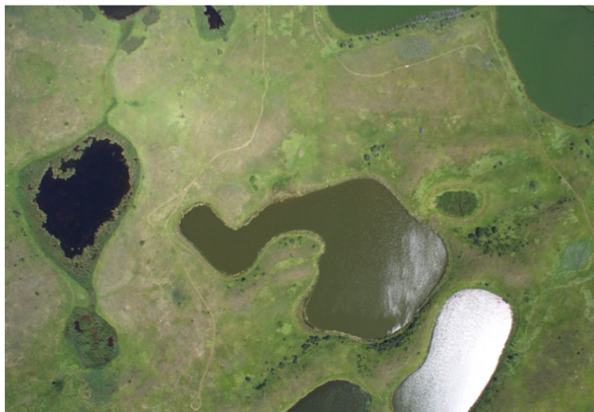
Fig. 2. Various forms/strengths of surface-water connections are visible in this aerial photograph of a prairie pothole wetland complex in Stutsman County, North Dakota, U.S.A. (Photo: D. Mushet).

Temporary wetlands provide valuable ecosystem services including wildlife habitat, nutrient flux to adjacent ecosystems, flood control, water filtration, and cultural services (e.g., Turner et al., 2008; Gascoigne et al., 2011; TSSC, 2012). The social importance of these features follows from the ecological importance of temporary wetlands enumerated above. For example, some wetlands, such as soaks associated with rocky outcrops, gnamma holes and gilgais, were an important source of water for indigenous communities as they enabled people to seasonally forage over areas that lacked permanent water (see Fitzsimons and Michael, this issue). Gilgais have also been used by